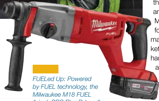
FUELed Up: Powered by FUEL technology, the Milwaukee M18 FUEL 1-inch SDS Plus D-handle rotary hammer drills faster than corded counterparts and claims to deliver a full day's worth of drilling on one charge.

develop a single battery system solution that meets the full range of user needs in each distinct SDS Plus rotary hammer market segment. These tools include a lightweight M18 5/8-inch tool for the compact segment, an M18 7/8-inch and M18 FUEL 1-inch tool for the medium segment, which makes up the majority of the market, and an M18 FUEL 1 1/8-inch hammer for the most demanding applications in the large SDS Plus segment.