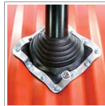
Standard Master Flash®