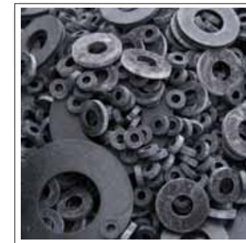
EPDM Rubber Washers