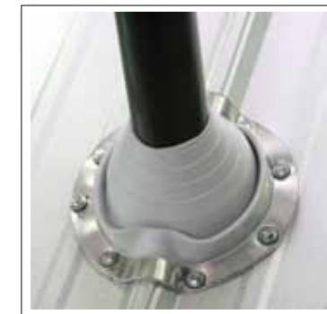
Universal Master Flash®