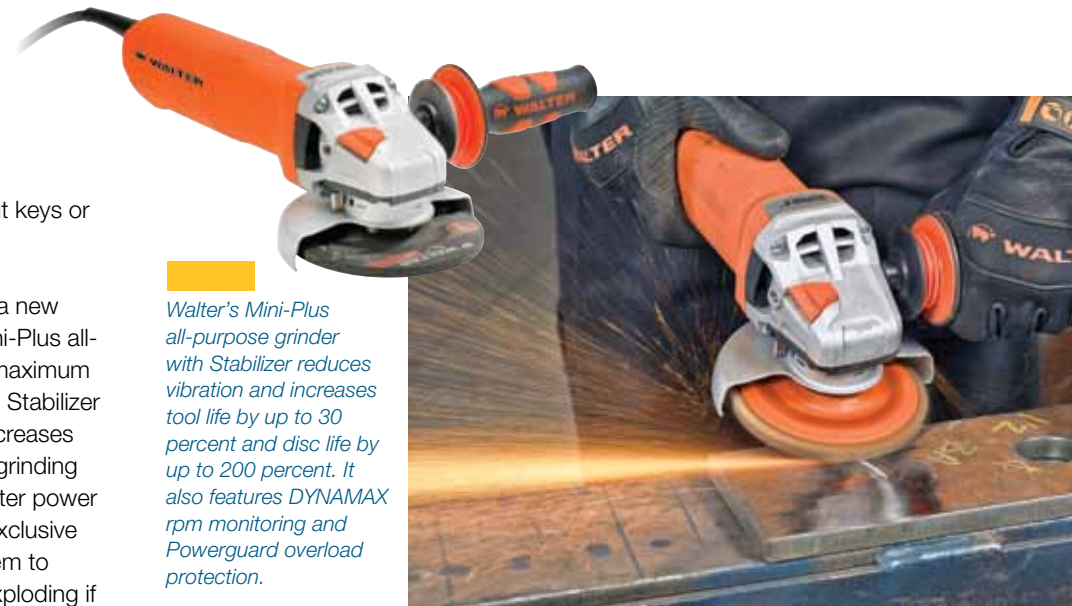
Walter's Mini-Plus all-purpose grinder with Stabilizer reduces vibration and increases tool life by up to 30 percent and disc life by up to 200 percent. It also features DYNAMAX rpm monitoring and Powerguard overload protection.

wheels in seconds without keys or wrenches.