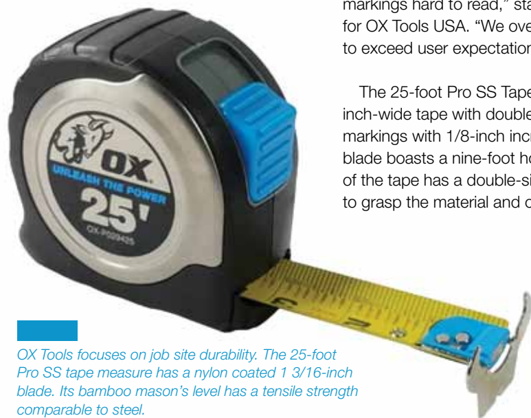
OX Tools focuses on job site durability. The 25-foot Pro SS tape measure has a nylon coated 1 3/16-inch blade. Its bamboo mason's level has a tensile strength comparable to steel.

The 25-foot Pro SS Tape Measure showcases a 1 3/16-inch-wide tape with double-sided, easy-to-read inch fractional markings with 1/8-inch increments. The nylon coated tape blade boasts a nine-foot horizontal standout. The business end of the tape has a double-sided tang that offers multiple points to grasp the material and can also sit flush with metal.