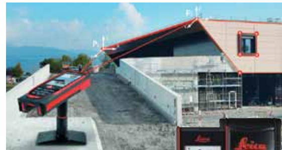
Leica’s 100-meter Disto D2 has ISO 16331-1 accuracy and Bluetooth. The Disto S910 100-meter is the world’s first laser distance meter with the P2P Technology. It has a range of up to 300 meters.

“As the market heads further into cloud-based workflows, our Bluetooth laser measuring devices continue to add value to customers looking for high accuracy and time savings,” Hobson adds. “We will continue to provide our customers with the best lasers on the market, and look forward to seeing you at the upcoming STAFDA show in Atlanta.” CS