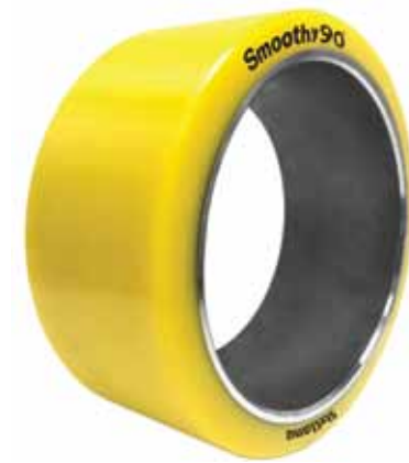
Reinventing the wheel sometimes means just that. Smoothy90 polyurethane press on tires from Stellana stay almost perfectly round under heavy loads yet retain their sure-footed "road feel."

Tool and material handling benches, carts and workstations are invaluable for organizations but they are all vulnerable where the rubber hits the road. Polyurethane wheel and tire design has changed very little over the past 30 years. However, electric lift trucks have become bigger and faster and are able