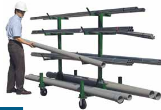
The support masts of Sumner MacRacks nest into their bases by pulling plunger pins. The entire racks fold in seconds for easy storage and even stack on each other for transport.