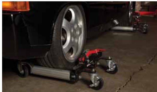
Sunex Tools' model 7708 Car Dolly set enables one person to safely lift and move cars and trucks with tires up to 12.8 inches wide.

to expand it so all our partners could benefit from it as well. We want to make sure that we’re not only delivering quality products, but also continuing to support our distributors.”