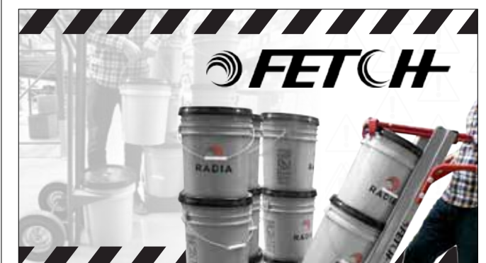
The height-adjustable, five-gallon dolly