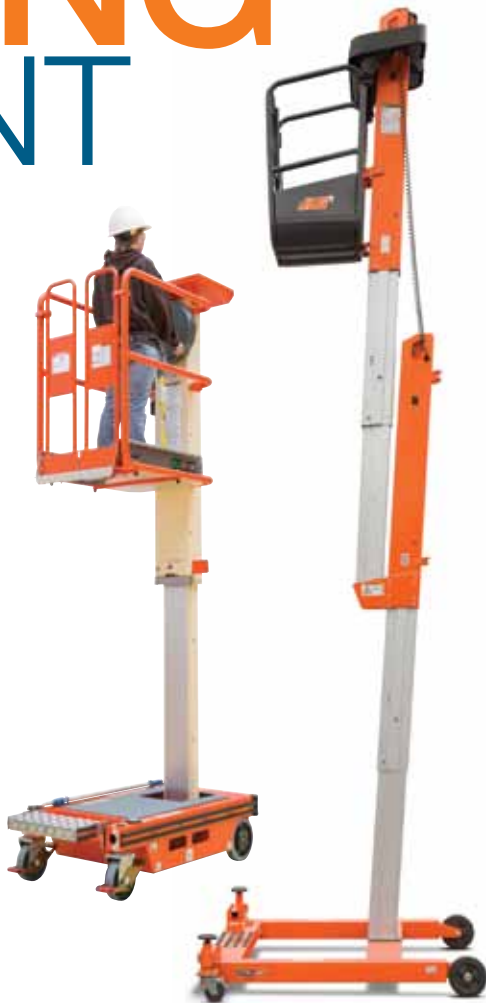
JLG's nonmotorized EcoLift 70 has a working height of 13 feet, 2.5 inches. JLG's Liftpod 140 is powered by a 40-volt battery and reaches a platform height of 13 feet, 6 inches.

Made of construction-grade materials, the rental-ready lifts offer unlimited lift cycles and can be used 24/7, contributing to a low total cost of ownership. The EcoLift 50 has a working height of 10 feet, 11 inches and the EcoLift 70 has a working height of 13 feet, 2.5 inches.