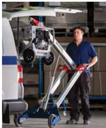
The Makinex Powered Hand Truck has won numerous awards for its ingenious ability to allow one person to lift and move objects weighing up to 309 pounds.