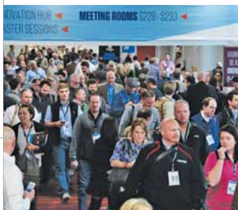
PHOTOS: NAHB INTERNATIONAL BUILDERS' SHOW