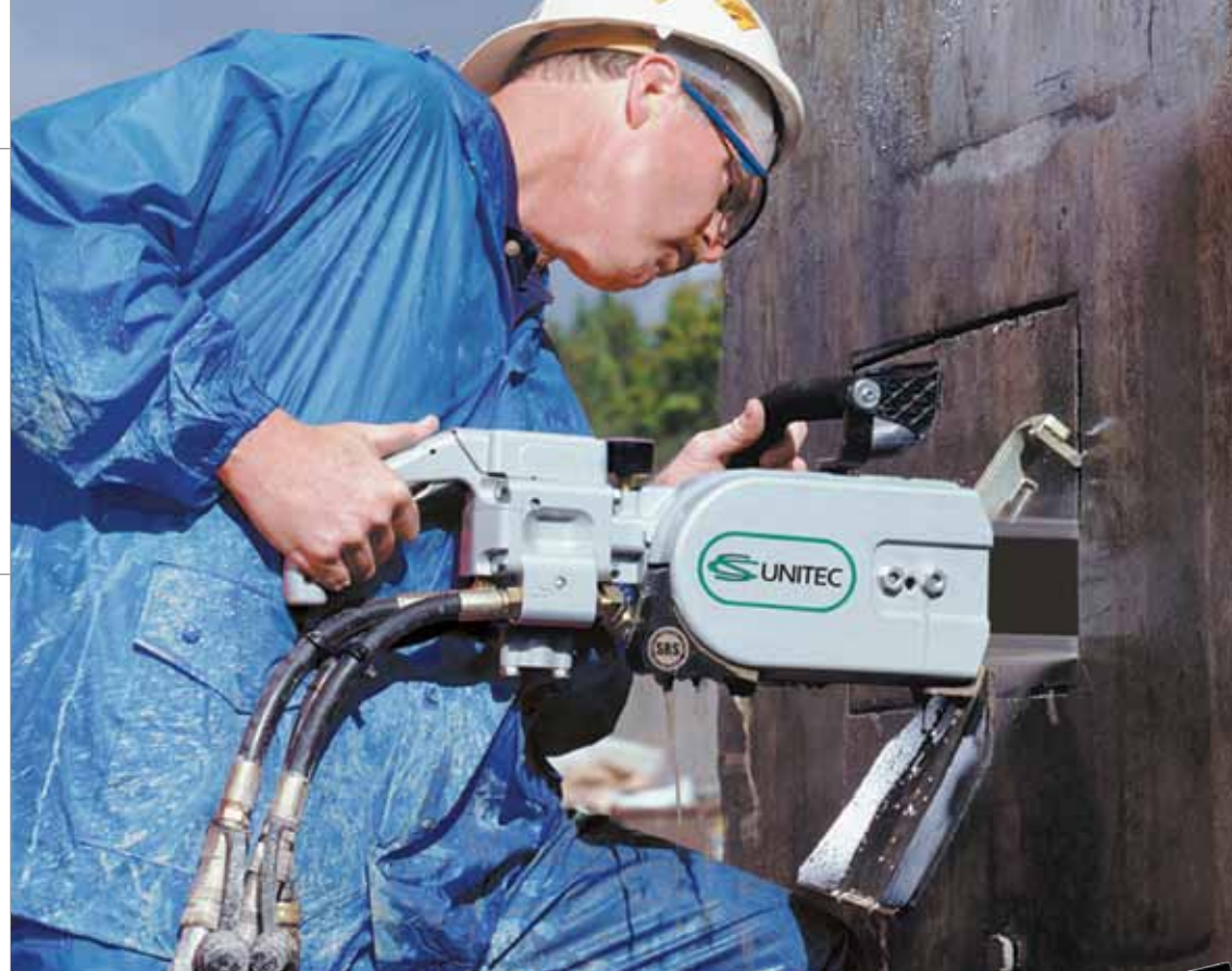
CS Unitec CS 566110-3 hydraulic saw plunge cuts up to 20 inches deep in one pass.