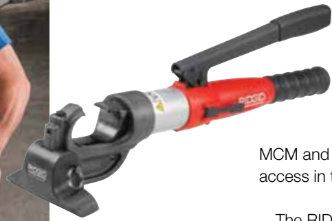
The RIDGID RE 12-M manual hydraulic crimp tool has a 1.65-inch jaw opening and can produce crimps up to 1,000 MCM and has a 330-degree rotating head for access in tight spaces.