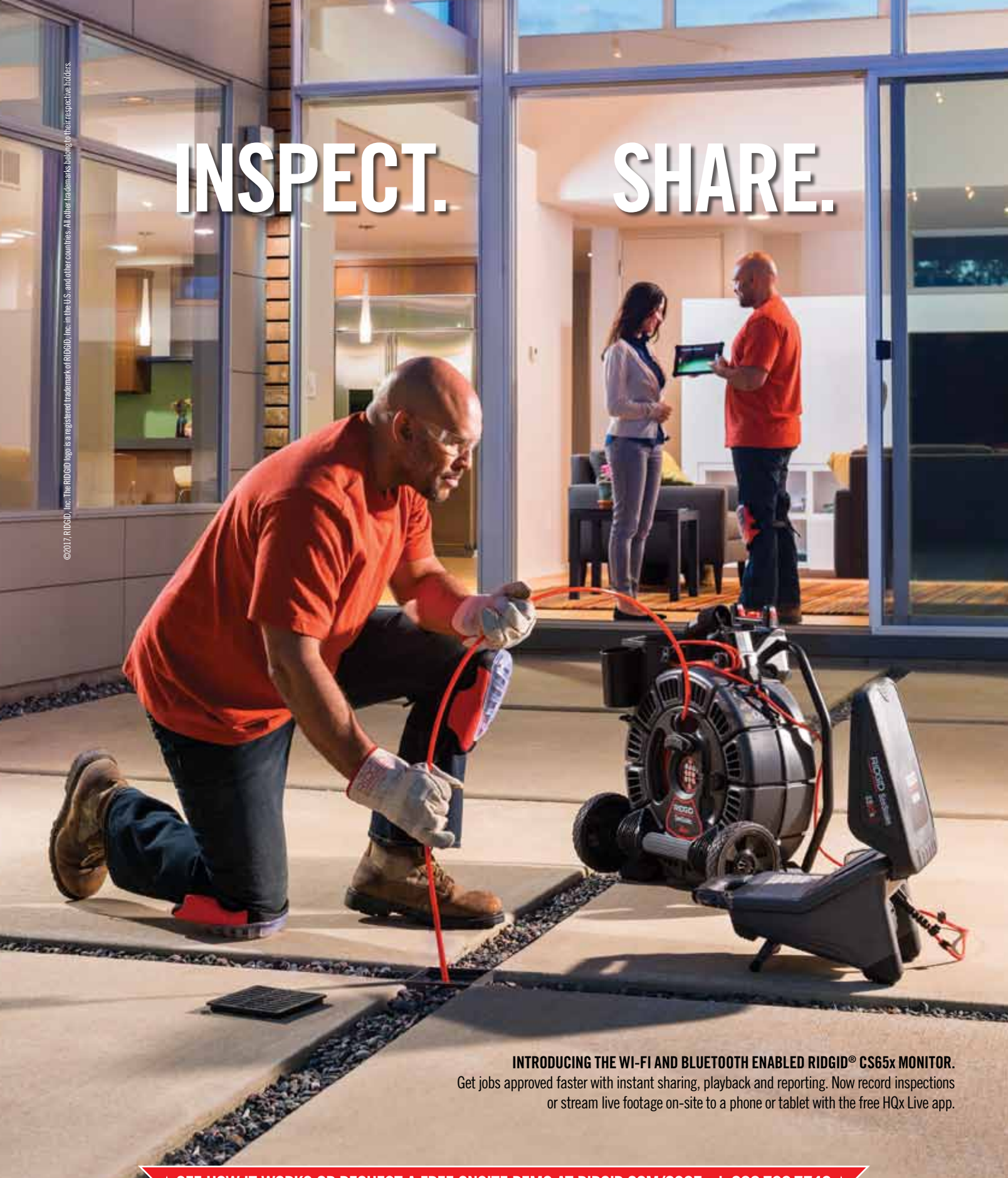
©2017, RIDGID, Inc. The RIDGID logo is a registered trademark of RIDGID, Inc. in the U.S. and other countries. All other trademarks belong to their respective holders.

INTRODUCING THE WI-FI AND BLUETOOTH ENABLED RIDGID® CS65x MONITOR. Get jobs approved faster with instant sharing, playback and reporting. Now record inspections or stream live footage on-site to a phone or tablet with the free HQx Live app.