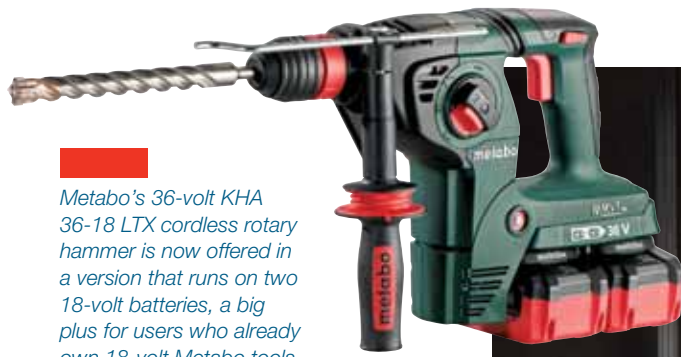
Metabo's 36-volt KHA 36-18 LTX cordless rotary hammer is now offered in a version that runs on two 18-volt batteries, a big plus for users who already own 18-volt Metabo tools.