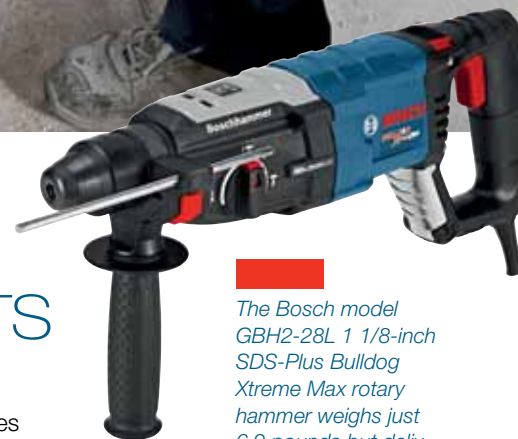
The Bosch model GBH2-28L 1 1/8-inch SDS-Plus Bulldog Xtreme Max rotary hammer weighs just 6.9 pounds but delivers 2.4 foot-pounds of impact energy.

Ideal for masonry pros or general contractors, this tool weighs only 6.9 pounds but delivers 2.4 foot-pounds of impact energy and 0-5,100 bpm. It has a multifunction mode selector for drilling versatility — drill only, hammer drill and chisel. This compact but powerful tool measures 17.4 inches long and 3.5 inches wide and has an impressive 1 1/8-inch drilling capacity in concrete.