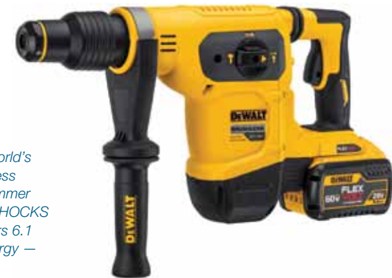
The new DEWALT DCH481X2 is the world's first 60V MAX cordless SDS-Max rotary hammer with E-Clutch and SHOCKS technology. It delivers 6.1 joules of impact energy — with no cord.