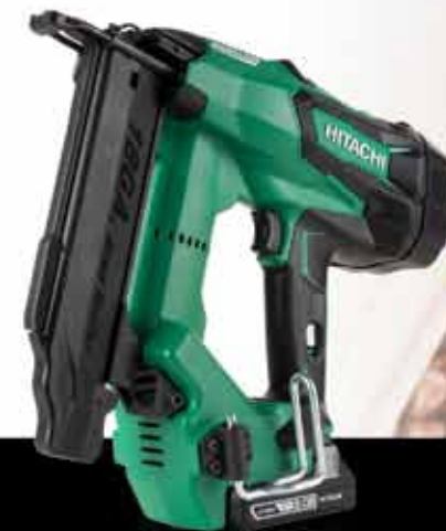
NT1850DE 18V Brushless 2" 18Ga Brad Nailer