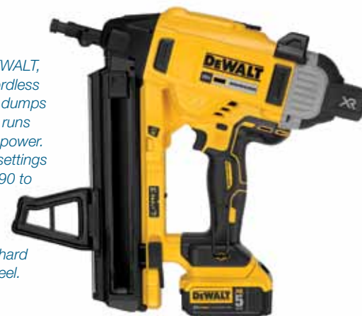
All new from DEWALT, the DCN890 Cordless Concrete Nailer dumps the fuel cell and runs on pure battery power. Variable power settings allow the DCN890 to be adjusted for applications ranging from hollow block to hard concrete and steel.