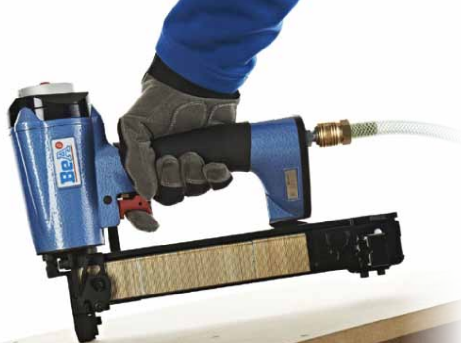
The German engineered and manufactured BeA model 14/40-770C shoots 16/17 gauge staples up to 1 5/8 inches in length. It is available in single-shot or bump-fire versions.