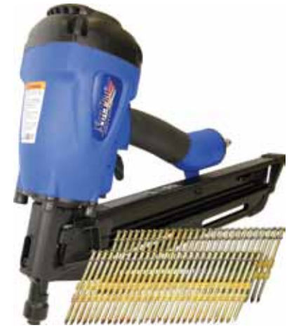
JAACO's NP-9021D Combo Duplex & Framing Nailer easily handles four types of fasteners including duplex and framing nails, ballistic pins and colleted screws.

for hardened pins, standard and specialty nails.