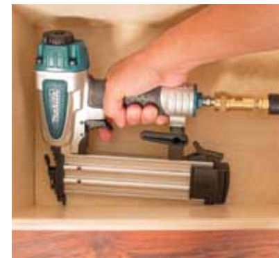
Makita is expanding its pneumatic trim fastening system with five new models, including the 2-inch 18-gauge AF505N brad nailer with a narrow nose design that's ideal for work in tight spaces.