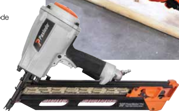
Above: Paslode's Cordless XP Framing Nailer has 15 percent more power to drive nails flush even into LVL. Left: The Powermaster Pro Framing Nailer weighs 7.9 pounds, 1/2 pound less than its predecessor.

their productivity and reduce fatigue on the jobsite.