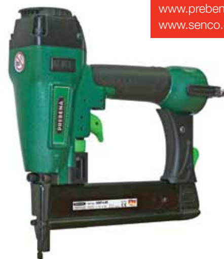
Made in Germany, the Prebena model 3GP-L40 shoots 16-gauge 7/16-inch crown staples up to 1 1/2 inches long and weighs just 3.5 pounds.

The 3GP-L40 stapler is for 16-gauge 7/16-inch crown staples up to a length of 1 1/2 inches. As this tool is very light weight at approximately 3.5 pounds and