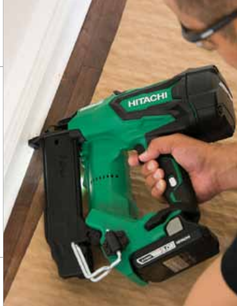
Hitachi's feature-packed model NT1850DE 18-gauge cordless brad nailer has a brushless motor and is powered by a compact 3.0 Ah Lithium-ion battery. It has an LED worklight and holds 100 5/8- to 2-inch fasteners.

savings without compromising quality," McCutcheon adds. "Be on the lookout soon for a new F44AC 0-degree coil siding nailer, which will create a system solution for the 0-degree siding market. Also on the near horizon is the F30AT 16 gauge bradder, a new feature-rich product that will expand the brad and pin tool lineup."