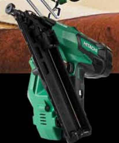
NT1865DMA 18V Brushless 2-1/2" 15Ga Angled Finish Nailer