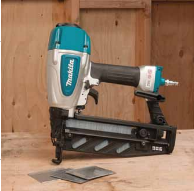
Above: The Makita model AF601 Straight Finish Nailer weighs 3.8 pounds and shoots 16-gauge finish nails from 1 to 2 1/2 inches long. It also has a two-mode selector switch.

mechanism, a two-mode selector switch and is engineered for all-day professional use.