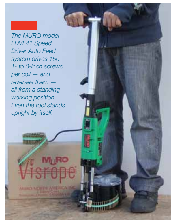
The MURO model FDVL41 Speed Driver Auto Feed system drives 150 1- to 3-inch screws per coil — and reverses them — all from a standing working position. Even the tool stands upright by itself.