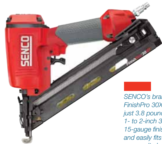
SENCO's brand new FinishPro 30XP weighs just 3.8 pounds, drives 1- to 2-inch 34-degree 15-gauge finish nails and easily fits into tight spaces. It also carries a five-year warranty.

NAILPRO Specialty Fasteners are manufactured and marketed through JAACO Corporation, a Taiwan-based company that in addition to being ICC-ES approved, also belongs to ISANTA, the International Staple, Nail, and Tool Association; AWCI, the Association of the Wall and Ceiling Industry; and has been a STAFDA associate member since 1996. The company's U.S. offices are in Redmond, Washington. JAACO manufactures more than 2,000 types of fasteners and a variety of pneumatic and fuel cell tools