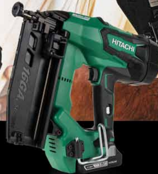
NT1865DM 18V Brushless 2-1/2" 16Ga Straight Finish Nailer