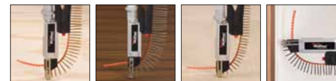
Subfloor Decking Cement Board Drywall

WE'LL PROVE IT! Contact us for a FREE Tool Trial 800-518-3569