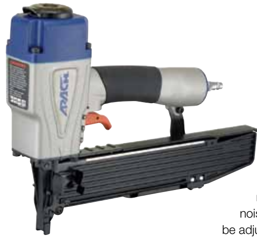
The Apach LU-216LC1 16-gauge medium crown stapler from Axxis fires both SENCO and Duo-Fast type staples from 1 to 2 inches in length. It weighs 4.8 pounds and can fire up to 13 staples per second.