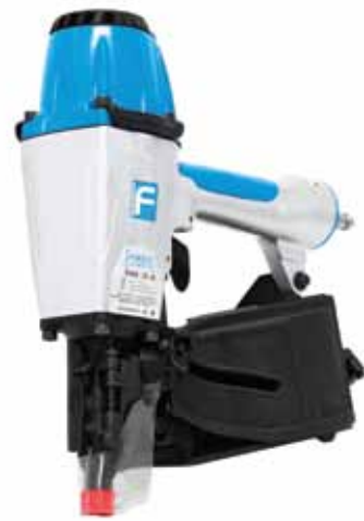
FASCO's F44AC CN 15W-PS65 15-degree wire- and plastic-coil nailer has a capacity of 200 to 400 nails and shoots 1- to 2 1/2-inch fasteners. It weighs 5.29 pounds and has a switchable trigger for single shot or bump-fire operation.