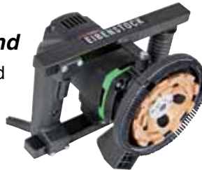
5" EBS 125.5 D