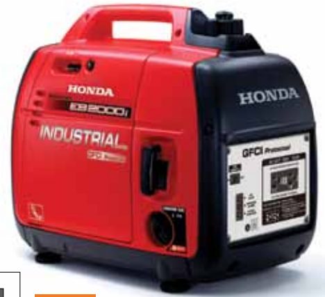
Honda's EB2000i inverter generator produces 2,000 watts of power and Honda's Eco-Throttle system saves fuel by delivering only the amount of power that attached equipment demands.

“An optional portability kit includes a handle, wheels and a front foot,” Lincoln adds. “If you’ve got a tough job to do, look no further than the XD5000E professional generator.”