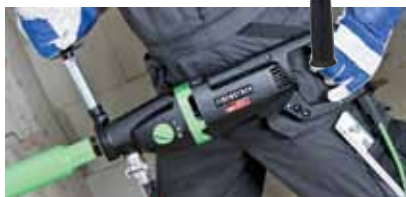
END 130/3 P