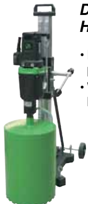
EBM 350/3 PSA