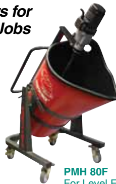
PMH 80F For Level Floors