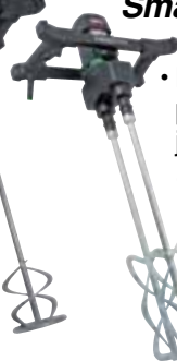
EZR 22 R/RL