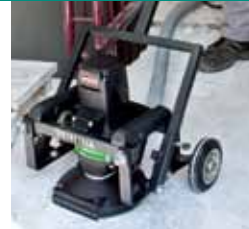
Hand-held with optional walk-behind cart