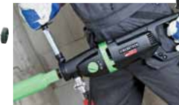
END 130/3 P