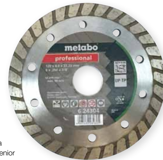
Metabo's new 5- by 1/4-inch Professional tuck pointing blade features a sandwich design that requires less power from the grinder to perform its work.