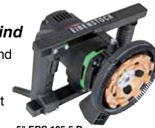
5" EBS 125.5 D