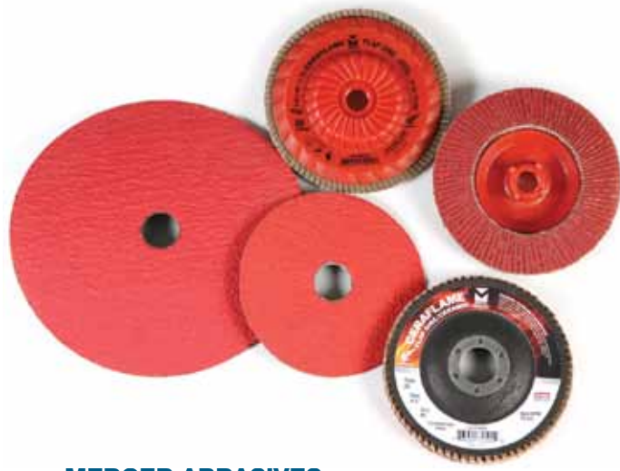
Mercer's Ceraflame line, with ceramic grain technology that outlasts zirconia by up to 50 percent, is designed for aggressive removal in steel, cast iron, ceramic, stainless steel and other non-ferrous metals.