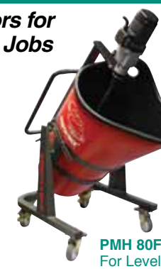
PMH 80F For Level Floors