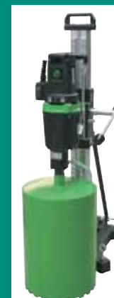
EBM 350/3 PSA

Diamond Core Drills – Hand-held or Rig-mounted