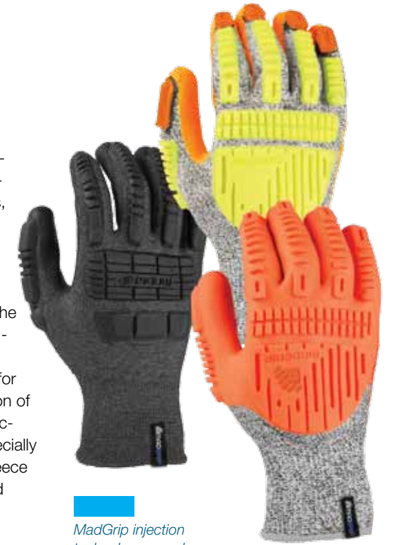
MadGrip injection technology seamless Ergo Impact, Ergo Defender and Ergo Beast safety gloves use a softer TPR than competitive processes for an enhanced ergonomic fit.