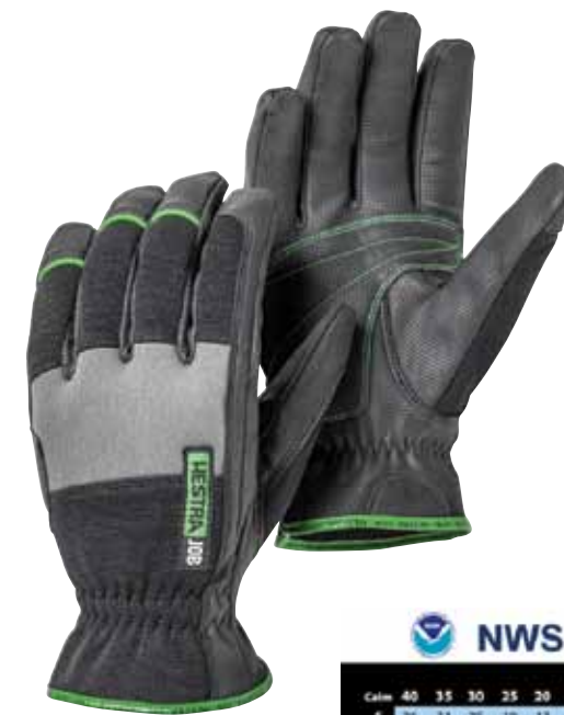
The Hestra JOB Omega glove for light-duty work is washable and features pre-curved fingers, a Spandex backhand and Neoprene-reinforced knuckle protection.