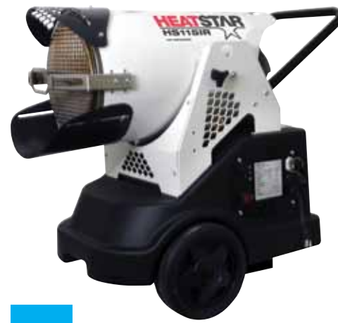
The 115,000 Btu Heatstar HS115IR oil-fired infrared radiant construction heater is quiet, low-odor, smokeless and transfers heat similar to the sun’s rays, even in high wind and wintry conditions.

“Heatstar’s CSA certified heaters are built from heavy-duty steel with larger solid wheels, an adjustable floor heat shield and sturdier