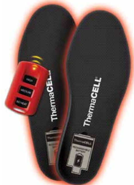
ThermaCELL ProFLEX heated insoles feature a wireless remote and are rechargeable for hours of controllable warmth at either 100 or 110 degrees. Each pair lasts more than 2,500 hours — four winters of heavy use.

“ThermaCELL Heated Products introduced Heat Packs this year for portable, rechargeable heat that can fit anywhere you need it, from a pocket to your gloves!” says Arthur