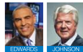
Football legends, Herm Edwards and Jimmy Johnson , will then coach members on "Winning in Business...and in Life!"