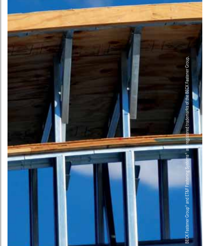
BECK Fastener Group® and ET&F Fastening Systems® are registered trademarks of the BECK Fastener Group.

Light gauge steel fastening solutions from ET&F.