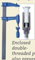
Enclosed double-threaded piston also prevents glue clogging!

When you're in the middle of a crucial project, there's no time for clamps that can't hold their own. The ingenious double-threaded piston system and flip-up handle of the new Rockler F-Style Clamp provides quick adjustment and excellent clamping power. You get dependability and peace of mind every time, so you can create with confidence.