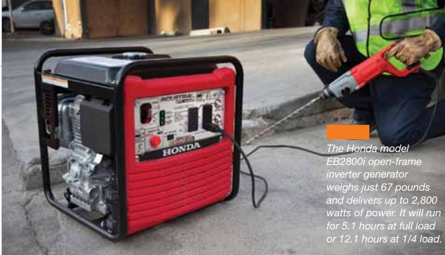
The Honda model EB2800i open-frame inverter generator weighs just 67 pounds and delivers up to 2,800 watts of power. It will run for 5.1 hours at full load or 12.1 hours at 1/4 load.

leading inverter technology and innovative features at an affordable price for industrial users.”