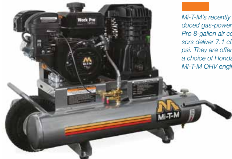
Mi-T-M's recently introduced gas-powered Work Pro 8-gallon air compressors deliver 7.1 cfm at 90 psi. They are offered with a choice of Honda or Mi-T-M OHV engines.

Mi-T-M Work Pro Series air compressors are designed specifically for professional contractors and serious DIYers. Their easy-to-use components and wheelbarrow design make them extremely portable. Powder-coated tank receivers sit on base plates designed to reduce vibration and both the single- and two-stage models can power everything from impact wrenches to drills and nail guns.