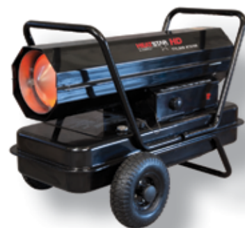
FORCED AIR KEROSENE 50,000-210,000 BTU

America’s Most Complete Line of Portable Heaters