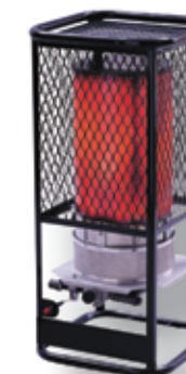
PORTABLE RADIANT 35,000 BTU (LP) 125,000 BTU (LP/NG)