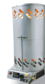
CONVECTION 60,000 BTU (NG) 80,000-200,000 BTU (LP)