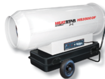
HEAVY-DUTY DIRECT FIRED 350,000-600,000 BTU