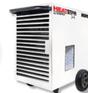
NOMAD BOX HEATERS 115, 190, 260,000 BTU