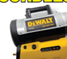
FORCED AIR PROPANE 68,000 BTU