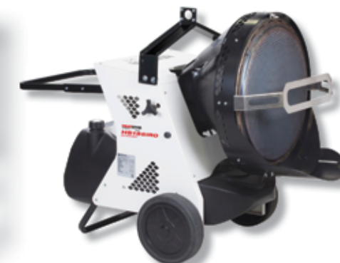
OIL-FIRED RADIANT 115,000-155,000 BTU