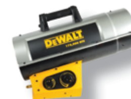
FORCED AIR PROPANE 40,000-210,000 BTU