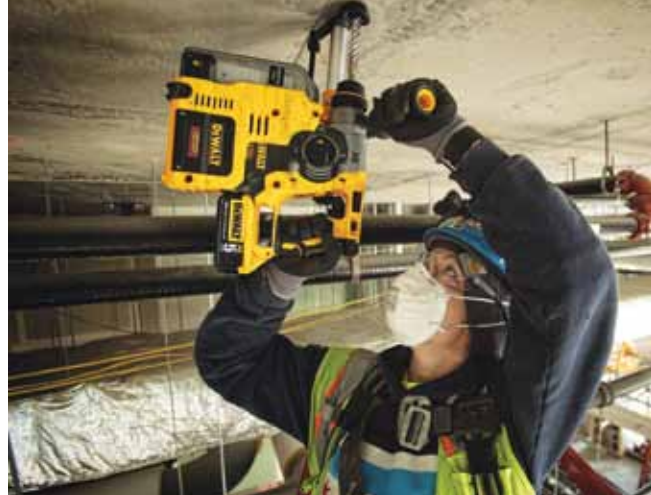
DEWALT’s newest option for OSHA-compliant portable drilling is the D25303DH Dust Extractor, shown here attached to a DEWALT DCH273P2 1-inch 20V MAX SDS Plus rotary hammer.

DEWALT has been in the forefront of driving dust management on job sites for years as part of their Perform & Protect Strategy. So, when OSHA’s ruling on crystalline silica was announced, DEWALT was ready with a full suite of dust solutions to support the user comply with the new regulation. DEWALT provides a Table 1-compliant solution for almost all applications which does not require the need to provide objective data and is a huge benefit to users who implement Table 1 controls as method of compliance.