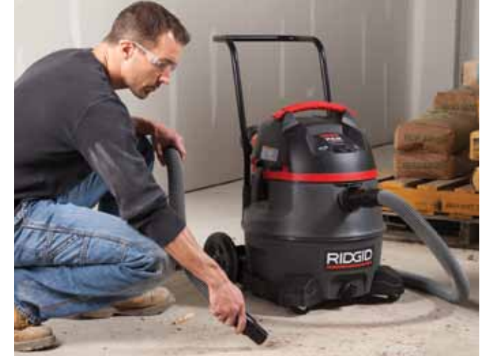
The 14-gallon RIDGID 3410RV Smart Pulse Wet/Dry Vac features a self-cleaning dual filter system with an integrated sensor that continuously monitors suction.

“With cordless tools gaining momentum on job sites, DEWALT has launched an onboard dust extractor used along with their cordless SDS+ hammers that is compliant to OSHA Table 1, using a patented filter cleaning mechanism,” Srinivasan says.