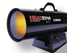
FORCED AIR PROPANE 35,000-400,000 BTU