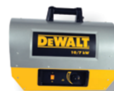
HEAVY DUTY ELECTRIC 1.65-20 kW