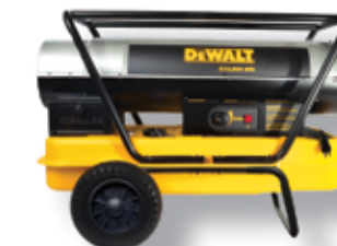
FORCED AIR KEROSENE 50,000-215,000 BTU

www.heatstarbyenerco.com or call 866.447.2194.