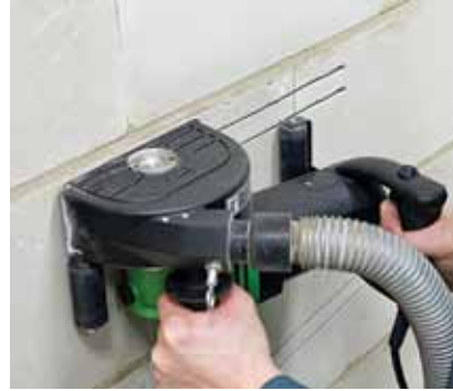
CS Unitec's comprehensive tool-and-vacuum systems include hand-held and walk behind concrete grinders; a 7-inch wet/dry electric diamond circular saw for stone and concrete; a 5-inch saw for tile and stone; and 6- and 7-inch wall slotters.