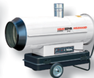
HEAVY-DUTY INDIRECT FIRED 100,000-400,000 BTU