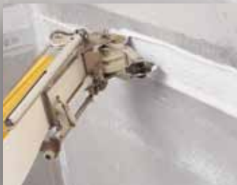
EasyClean® Automatic Taper