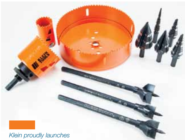
Klein proudly launches an all-new line of bimetal hole saws, double-fluted step bits and wood boring bits engineered to deliver faster drilling and cutting performance and longer tool life.

for fast, superior cutting and is engineered for longer-lasting performance and higher durability. The line includes new bimetal hole saws, double-fluted step drill bits and wood boring bits.