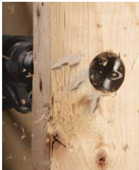
Bosch Daredevil spade bits feature a contoured paddle that delivers 10 times the drilling speed of a conventional spade bit. A spur-and-reamer design provides clean hole entry.

In 2016, the Bosch system will be optimized for adhesive anchoring applications with Simpson Strong-Tie adhesives. This "drill and fill" system means fewer steps per installation, which reduces human error for greater consistency, reduces installation time by up to 50 percent and controls overall installation cost. CS