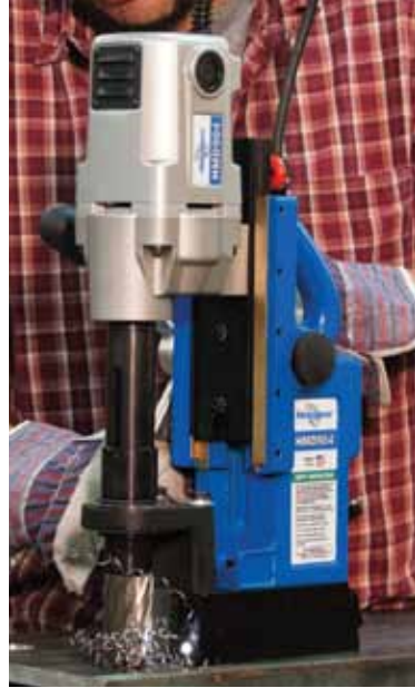
Hougen's new mag drills, such as the HMD904 drill shown here, feature numerous improvements including LED lighting, more power and torque.

low- or no-light conditions. Other features include a new slot drill arbor system for easier accessory change out and a two-stage magnet that increases holding power by 30 percent when the motor is engaged. New two-speed motors have increased torque on some models by 133 percent.