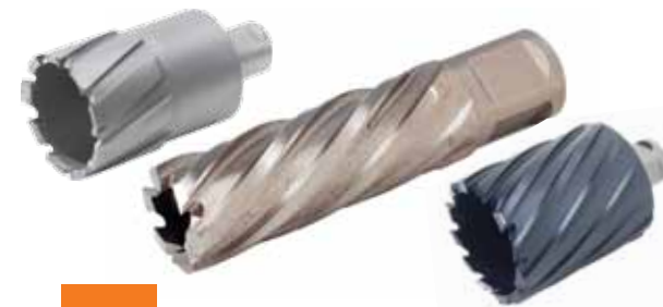
Walter's next-generation annular core cutters are more impact- and stress-resistant, less brittle and are impervious to deformation. They include three lines: SST Core Cut, ICECUT and Carbide Core Cutters.

The ICECUT core cutter has a heat resistance over 500 C higher than a titanium-coated cutter and over 200 C higher than a titanium-aluminum blend, making it the most heat-resistant core cutter available. In addition, both the SST and ICECUT are designed with an exclusive multiple tooth design with various heights and depths for faster drilling.