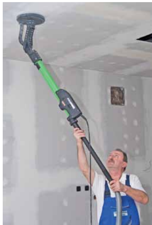
The ELS 225.1 drywall sander from CS Unitec has a 5.5-amp motor and extends up to nine feet. Its VacuGlide system grips the wall to make the tool feel 3.3 pounds lighter. It has a nine-inch sanding disc.