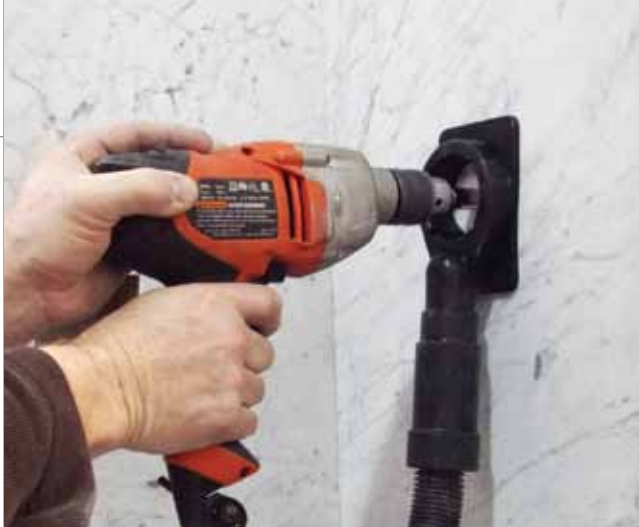
Alpha makes not just great tools, but great dust collection products too. Its Ecoguard shrouds and collectors work with many drills and grinders and minimize both dust and water to reduce clean-up time and improve productivity.